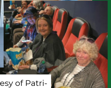
Enjoying a red carpet outing, courtesy of Patriot Place, to see "80 for Brady"