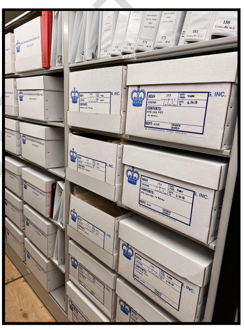
Organization After Improvements