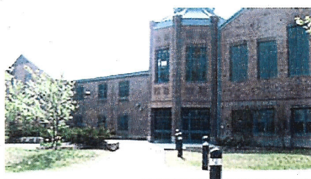
Remington Middle School

Franklin Public School System has a 14:1 Student/Teacher Ratio