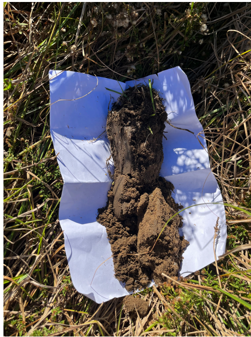
Photo 4. Soil Horizon A and B 2.5 YR 2/2 over 2.5YR4/4 (not hydric)