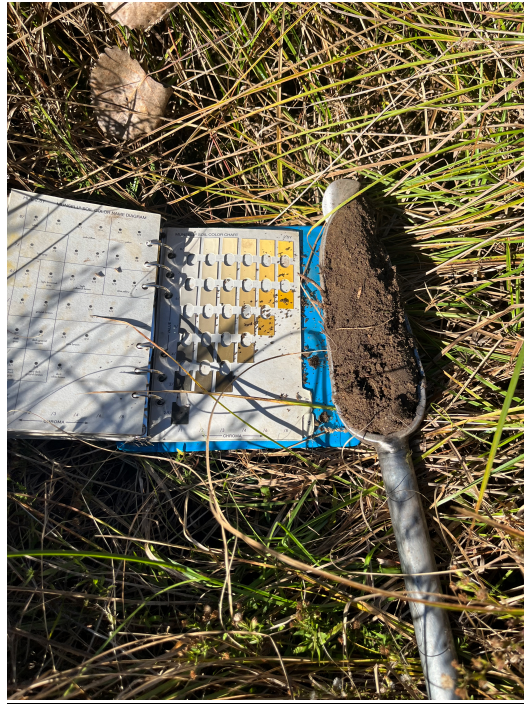
Photo 3. Soil Horizon 1 (Topsoil A layer) 8 inches of 2.5YR3/3 (not hydric)