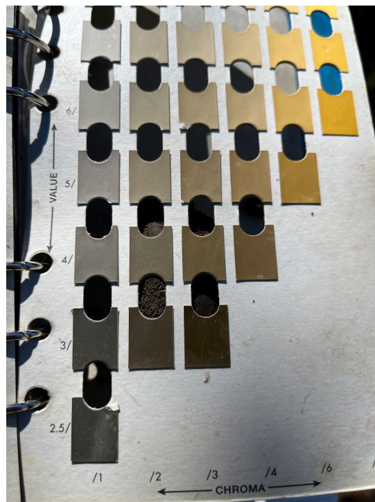
Photo 5. Soil Horizon 1 (Topsoil-A layer)-Showing value and chroma of soils: 2.5YR3/2 (not hydric)

Since Basin 3 is a narrow one transect was completed down the center of the area starting in the eastern section of the basin with Plot 1 and ending with Plot 5. Representative photographs of these soils are enclosed. Since the soils were consistent throughout the area only representative photographs are shown instead of the same photos presented at each plot (see photos on next page).