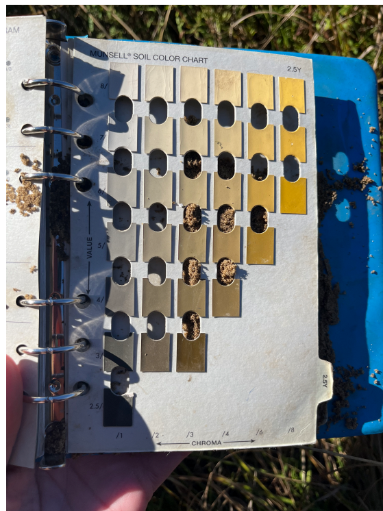
Photo 2. Soil Horizon 2 (Subsoil B-layer)- Showing soils of 2.5YR5/3 (not hydric)