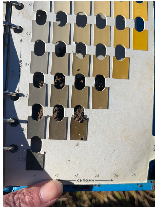
Photo 1. Soil Horizon 1 (Topsoil-A layer)-Showing value and chroma of soils: 2.5YR3/2 (not hydric)