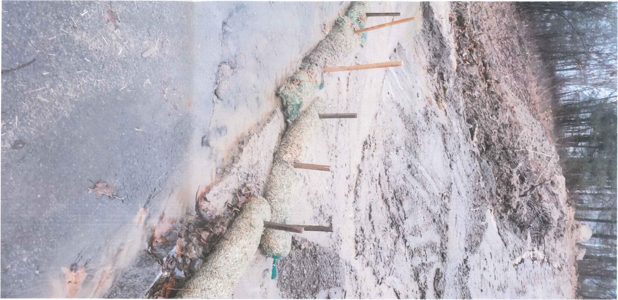
FIG1 140 LOUISE DRIVE'