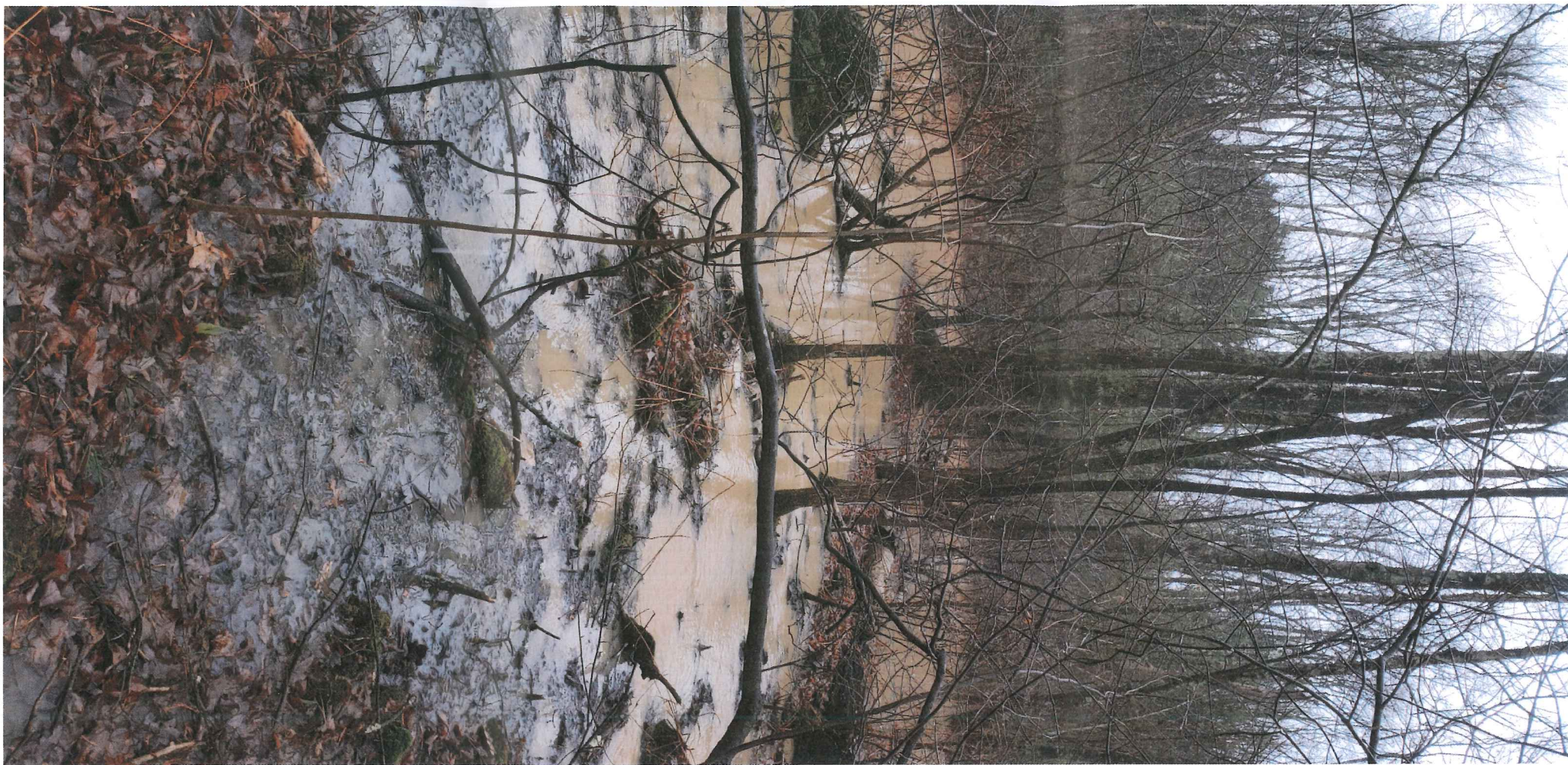
FIG 3 WETLAND 4 BYRONS WAY