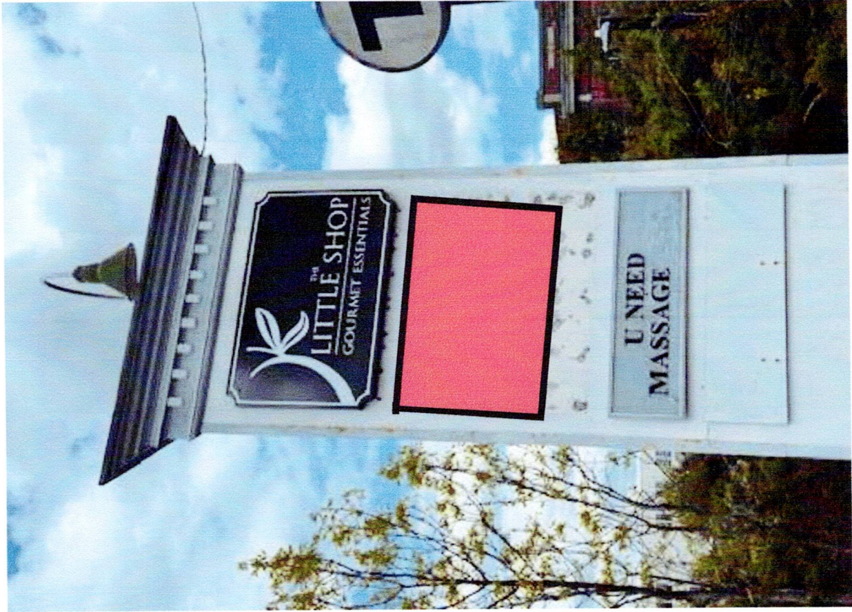
proposed location of new signage