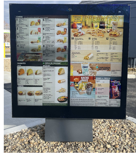
proposed digital menu board

Remove existing menu board Replace with new menu board Use same foundation - bolt system