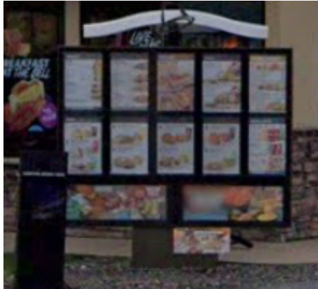
current menu board static menu in light box