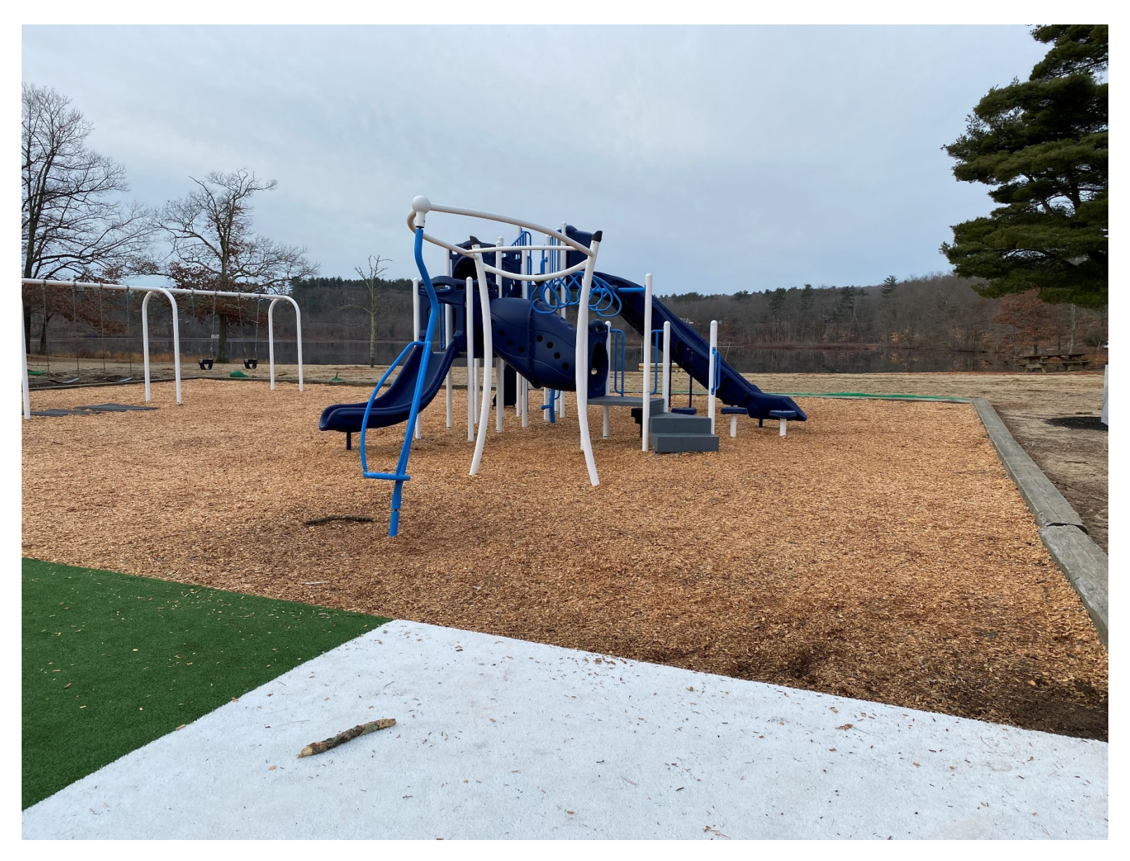
Photo 2 – View from Existing Fitness Area – same material as proposed turf