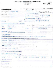
Farmers Market Application.tif 83K

Approval Letter_La Cantina_Franklin_121019.pdf 281K